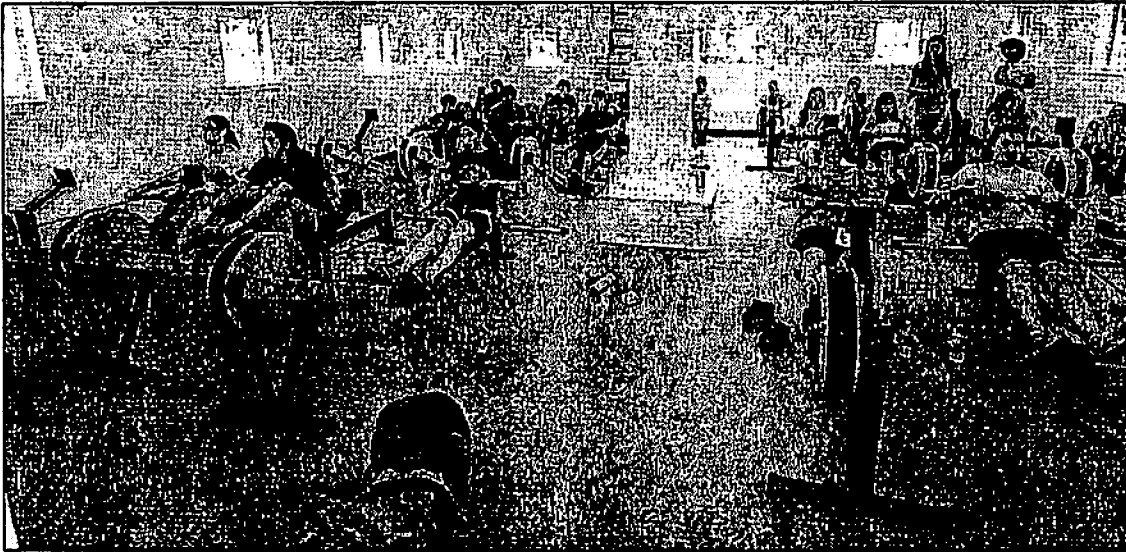
ROW, ROW, ROW YOUR ERG: DBMS students take advantage of the rowing room in the new building. The new facility houses this training center as well as office space, locker rooms and classroom space.